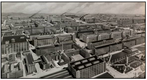
Endicott Johnson factories in the first half of the 20th century